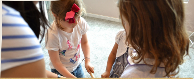
Music Group Lessons 音乐启蒙小组课