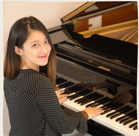
Study/Career Planning 音乐留学/创业策划