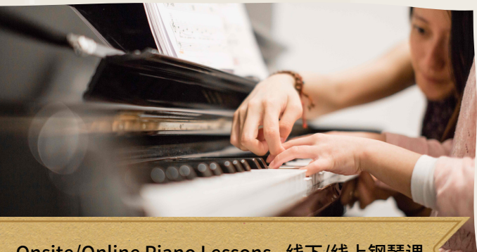
Onsite/Online Piano Lessons. 线下/线上钢琴课