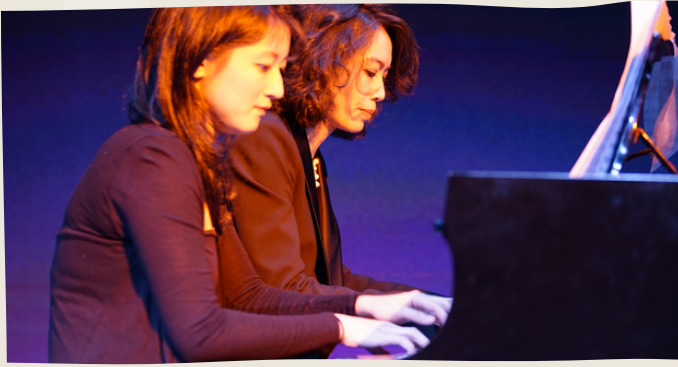
Performing & Programs Planning 演奏和项目策划