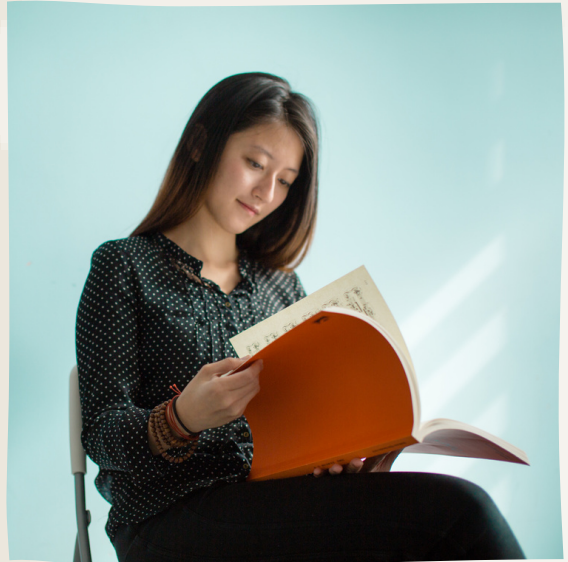
Teachers Training 教师培训